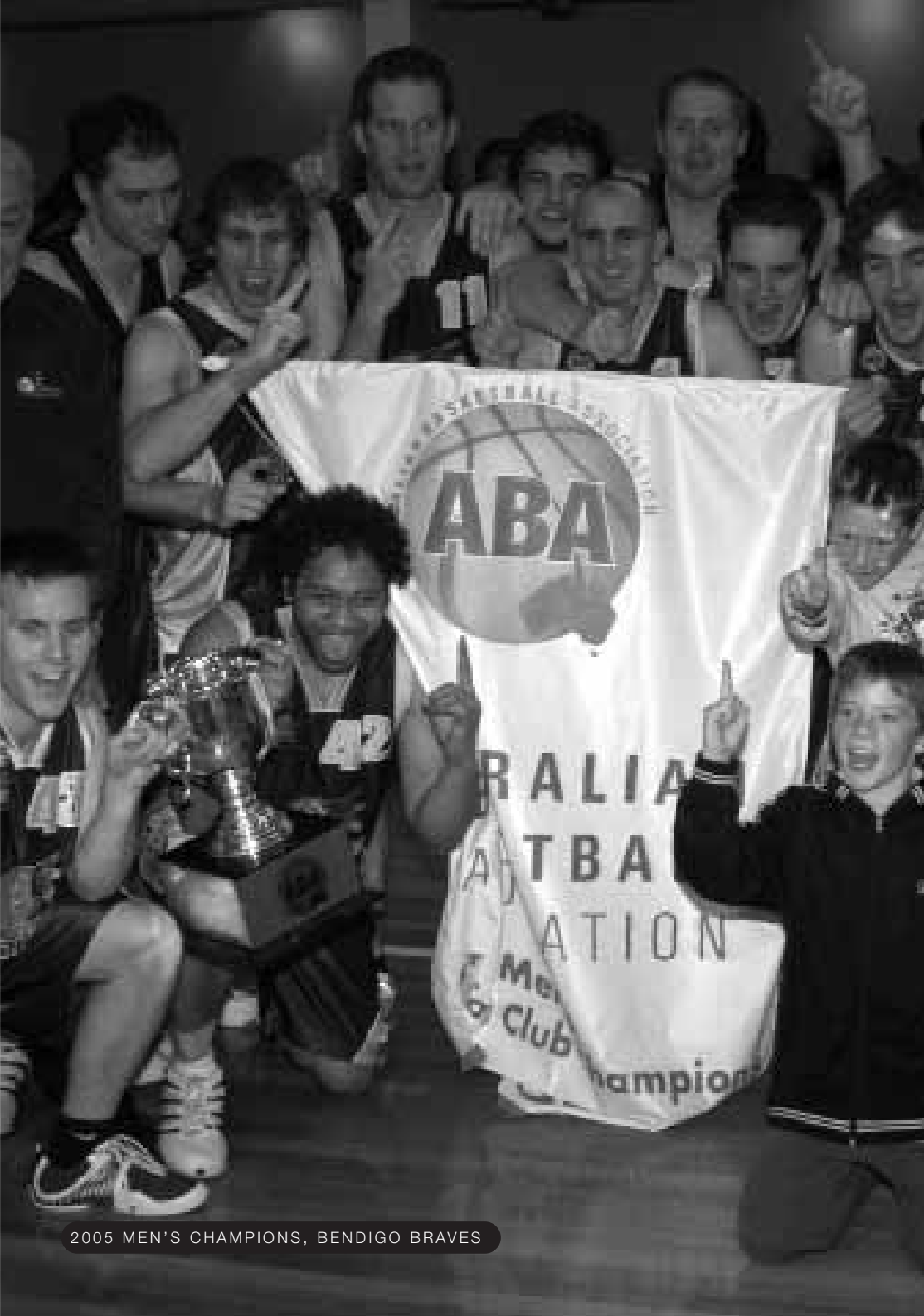
2005 MEN'S CHAMPIONS, BENDIGO BRAVES